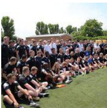
Y.C. Referees Assemble