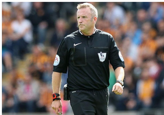
F.A. Cup Final Referee 2015 Jon Moss

For the second Conference in succession Jon Moss was the morning keynote speaker, and he did not disappoint. His free flowing style and care-free delivery had the audience in raptures. However, there was an important message to be gleaned from his presentation, basically if you want to progress in Refereeing sacrifices are necessary.