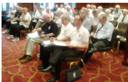
Delegates listen intently and make their notes