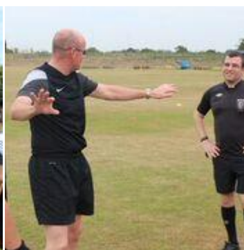
Lee Mason Up-skills Y.C. Referees